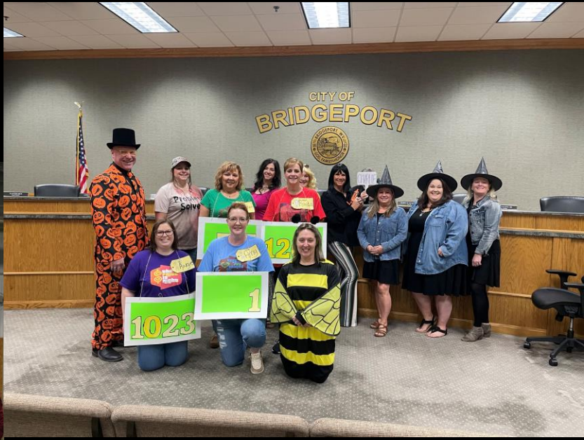
CITY HALL STAFF